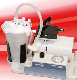
Filter/Aspiration Collection System