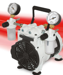
One-head w/controller, gauge

Known world-wide for speed, ease of use and long service intervals