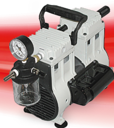
Two-head w/controller, gauge